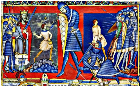
Illustration from the Winchester Bible