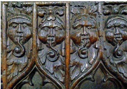
Medieval Wood carving in Higher Bickington Church, Devon

Dr Todd Gray's entertaining and informative talk will show us some fabulous examples of Devon's unique collection of wood carvings.