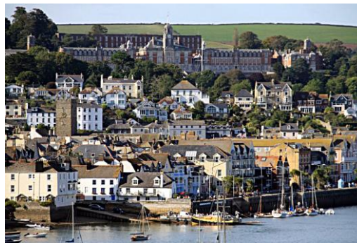
Dartmouth town with the college in the background

Morning walking tour of the town with a local guide. After lunch, we will be shown the historic highlights of Britannia Royal Naval College. Further details will be sent out nearer the time.