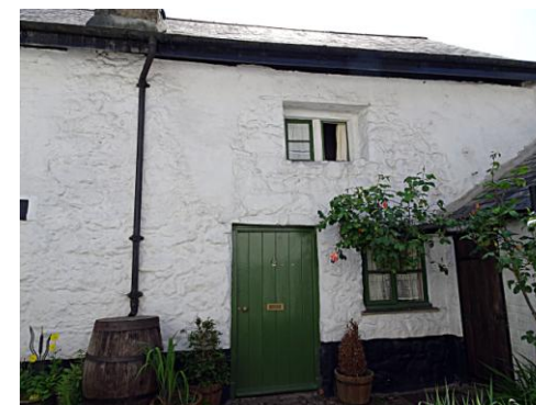
Where is Woolcomber's Cottage? AGM and Quiz 18 th October

Meetings are on the third Wednesday each month in the Stables Room at The Union Inn, 10 Ford Street, Moretonhampstead TQ13 8LN & start at 7.30 p.m. unless stated otherwise . Non-members welcome - £4 on the door (free if in full-time education).