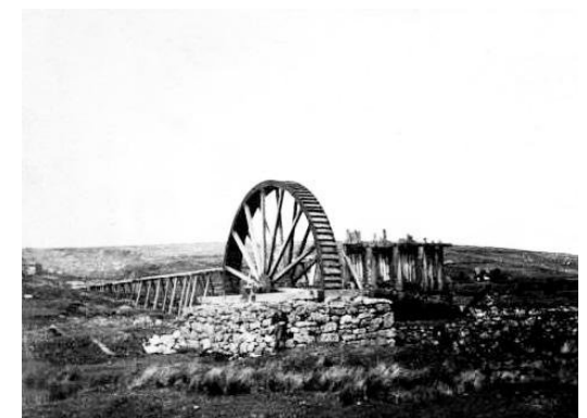
Whiteworks Water Wheel in 1889