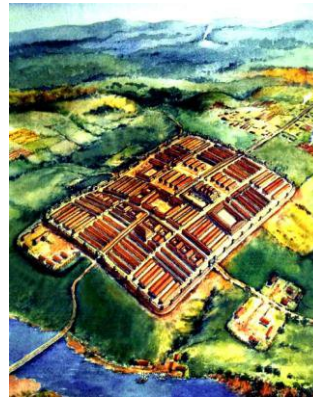
Artistic impression of Roman Exeter