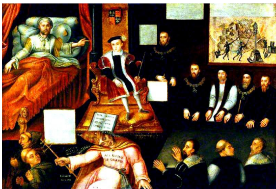
King Edward VI & other leading figures in the events of 1549